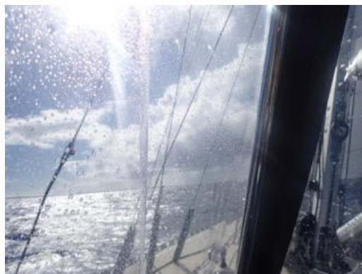
Water splashes on Hylander's dodger en route from Barbuda back to Antigua