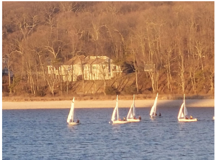
A little Frostbiting in the harbor a week ago. Taken from the PJ Ferry.